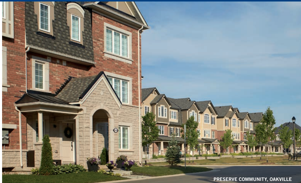
PRESERVE COMMUNITY, OAKVILLE

At Mattamy, we want to build for a better, greener future. For us, that means building smarter, more comfortable and efficient homes for our homeowners. We've built more ENERGY STAR® Certified homes across Canada than any other home builder. This has only encouraged us to look for more ways to create sustainable homes and communities across North America.